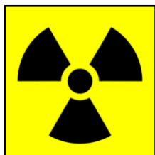
Figure 1: Radiation Hazard “Tri-Foil” Symbol.