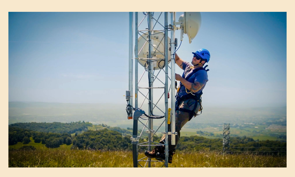
A contract technician installs wildfire detection cameras on a tower overlooking public lands managed by BLM Oregon/Washington

As climate change propels increasingly extreme wildfires, BLM is employing technology to improve early detection and assist with response operations. In 2023, the bureau expanded its network of wildfire detection cameras across the Pacific Northwest.