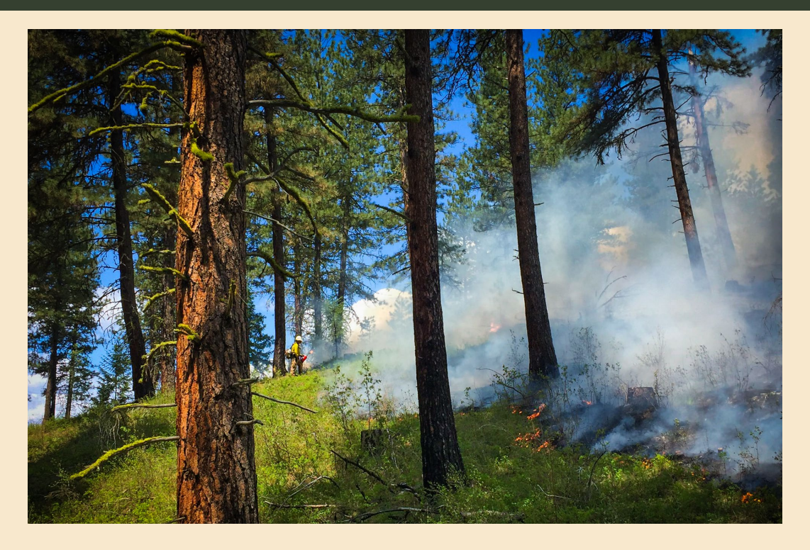
A wildland firefighter uses a drip torch to carefully ignite a prescribed burn in a conifer forest.

Every year, JFSP invites current master's and doctoral students to apply for Graduate Research Innovation (GRIN) awards. The awards focus on scientific studies related to wildland fire and are designed to help students currently enrolled in a U.S. university who want to expand upon their thesis or dissertation research.