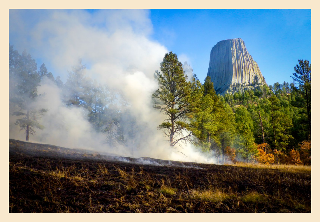
Devils Tower looms in the background during a prescribed fire at Devils Tower National Monument in October 2022.

Devils Tower is an astounding geologic feature that protrudes out of the prairie surrounding the Black Hills in Wyoming. It is sacred to Northern Plains Indians, and it attracts more than 500,000 visitors annually who support the local economy.