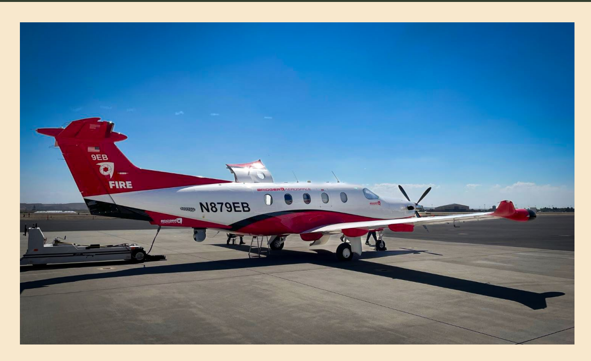
One of two new aircraft used for air attack and surveillance, for which BIA contracted during 2023, is inspected on the tarmac at the National Interagency Fire Center in Boise, Idaho.

Advanced aviation technology is helping BIA respond to wildfires with greater precision. In June 2023, BIA awarded contracts for two Pilatus PC-12 aircraft with advanced air surveillance and reconnaissance sensors. These single-engine aircraft fly over an incident, providing tactical coordination with the incident commander on the ground and directing airtankers and helicopters to critical areas of a fire for retardant and water drops.