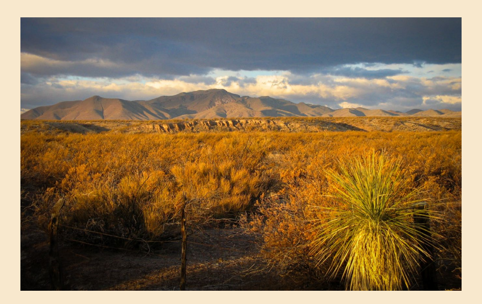
The diversity of native plant species, an important component of healthy wildlife habitat, has increased in Chupadera Mesa, New Mexico, as a result of fuels treatments.

The slopes and canyons of Chupadera Mesa in New Mexico are a patchwork of native grassland and piñon-juniper woodland and savanna. This landscape evolved with fire, which helped keep pinyon-juniper savannas open and grasslands diverse and productive for wildlife and ranching. Fire suppression in the twentieth century reduced these natural fire cycles. Combined with the spread of invasive weeds and climate change, this has led to extreme wildfire behavior across western rangelands that makes it increasingly difficult to conserve native sagebrush and grassland ecosystems.