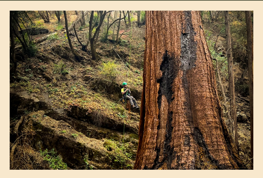
A cone collector rappels from a giant sequoia in the Cedar Flat Grove.

There is nothing like standing under a giant sequoia, the world's largest tree. If you perch at a sequoia's base and gaze up its massive red-orange trunk, it is easy to feel infinitely small as your eyes follow the corrugated bark hundreds of feet into the air.