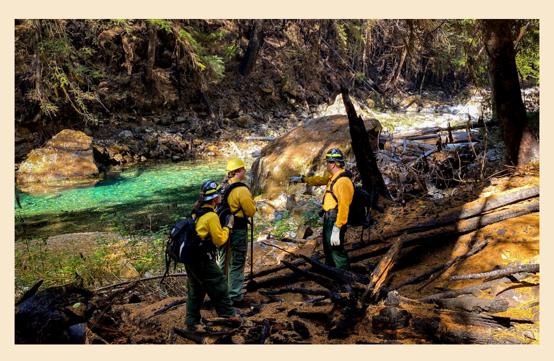
A representative of the Upper Skagit Indian Tribe discusses his concerns for post-fire conditions in Stetattle Creek with archaeologists on the Sourdough BAER team on September 13, 2023.

After firefighters have doused flames, and smoke is no longer in the air, in many cases, there is still work to be done. Post-wildfire hazards, such as flooding, erosion, and water quality issues, can create serious problems for residents and wildlife. Post-wildfire recovery starts with a Burned Area Emergency Response (BAER) team, often before wildland firefighters leave the area.