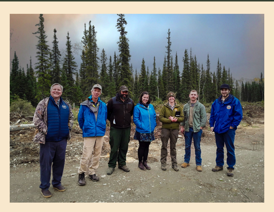
NPS staff and local leaders meet to strengthen community wildfire preparedness in the Anderson-Clear area north of Denali National Park and Preserve, Alaska.

In 1924, a large fire burned through the Nenana Valley and Riley Creek watersheds, an area that now contains most of Denali National Park and Preserve's critical infrastructure. A century later, park staff and local leaders are demonstrating the importance of partnership to create fire-adapted communities.