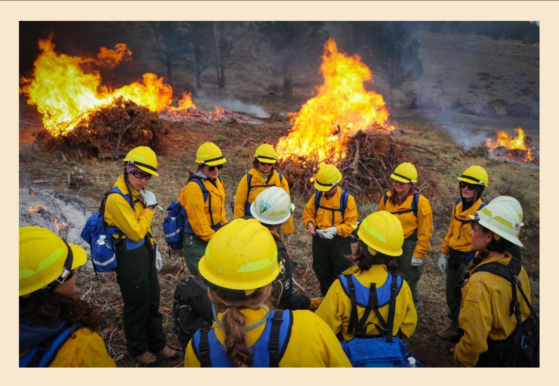
After lighting several wood piles during a training session, a group of boot camp participants gather for a briefing.

BLM developed the Oregon/Washington Vale District's Women in Wildfire Boot Camp to encourage more women to work in wildland fire and provide them with basic firefighting training. It has grown since the first camp in 2018. One of just a few firefighter training camps designed by women for women, it has attracted hundreds of participants from all 50 states and internationally.