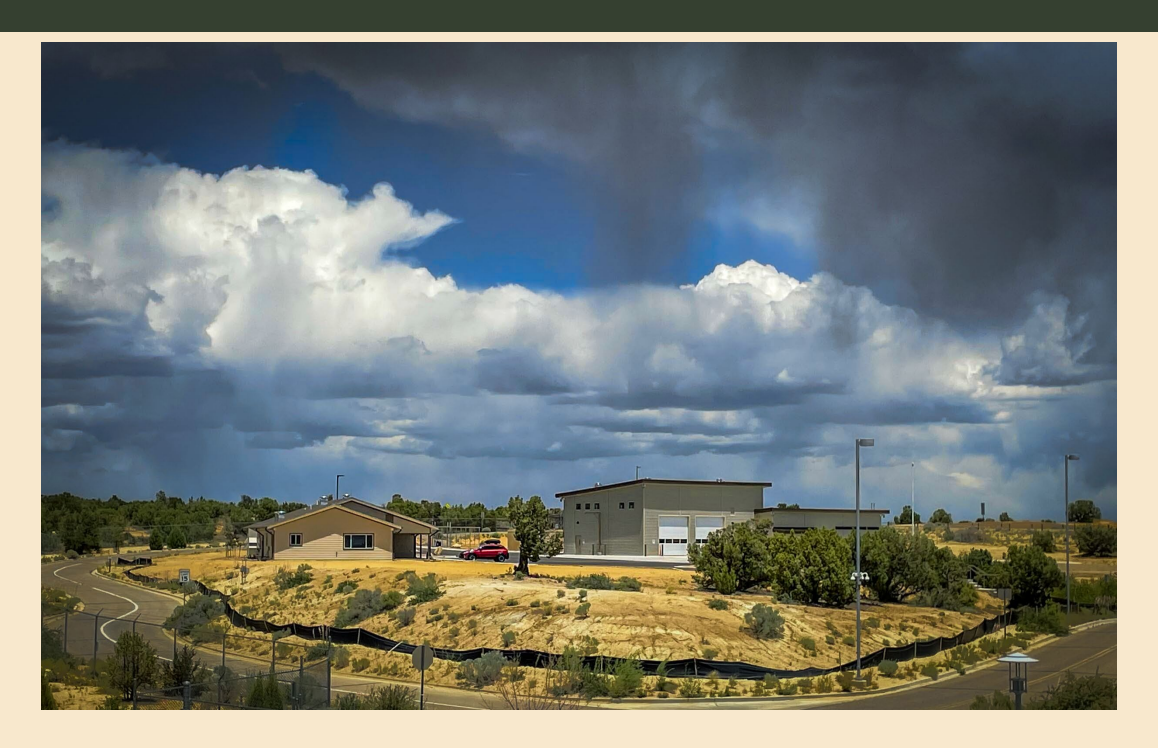
A new fire station and crew quarters constructed by BLM can be seen from the Farmington district office, New Mexico.

In 2023, BLM opened a new fire station and crew quarters buildings in Farmington, New Mexico, following years of planning, design, and construction work. The new facility was funded by the Facilities Construction and Maintenance subactivity, which funds facilities that help the Interior Department achieve its wildland fire mission.