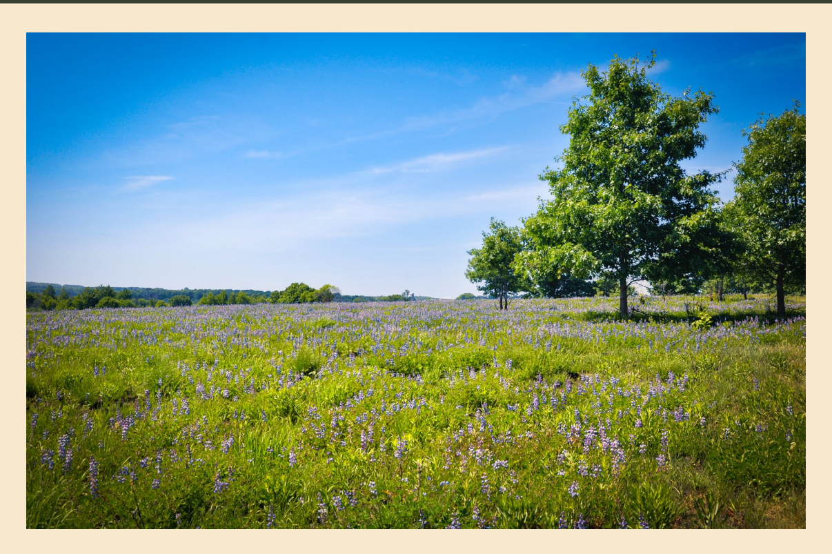
One month after a prescribed burn, blue lupine covers the area in a palette of purple.

The brilliantly-colored Karner blue butterfly, an endangered species, lives in oak savannas and pine barren ecosystems in western Wisconsin and eastward to the Atlantic seaboard. The larvae, or caterpillars, of these iridescent postage stamp-sized insects only eat wild blue lupine, a flower that needs wildfire to periodically clear the ecosystem of shrubs and trees that crowd out other plants.