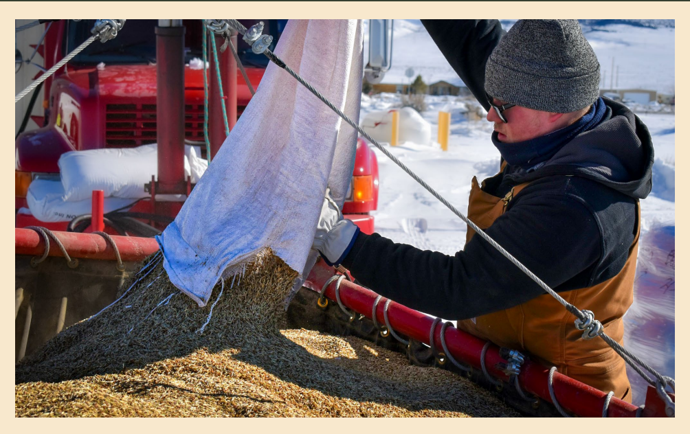
The bag attached to a boom truck is filled with native seeds in preparation for loading an Air Tractor 802 for an aerial seeding operation.

Stand on any small hill or mountain peak within the Great Basin ecosystem and you will be treated to vast expanses of dusty green sagebrush and melodious sage sparrow song. The ecosystem is home to hundreds of plant and animal species, and it supports the multi-billion-dollar Great Basin economy that contributes to the livelihoods of thousands of people.