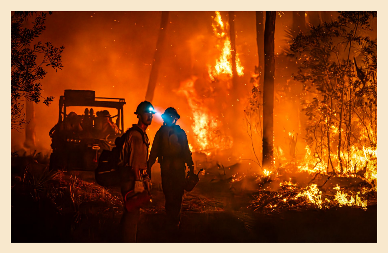
Ignition operations and holding crews work together to ignite a piece of line during prescribed fire operations in South Florida.

On a hot South Florida day in 2023, a dark gray smoke column rose out of the characteristically flat horizon, seemingly out of place in the clear blue sky. The first wildfire of the season had ignited. Within minutes, wildland firefighters were on the scene, swiftly suppressing the flames. Firefighters immediately began to protect nearby structures from the approaching fire front. Within hours, they had doused active flames and kept the fire from becoming a large and potentially devastating incident.