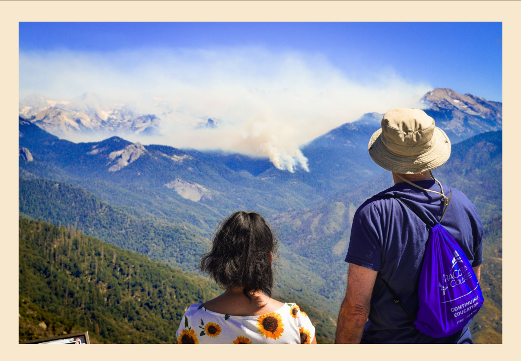
Visitors watching the Redwood Fire from Moro Rock in Sequoia National Park, California.

While suppressing wildfires is often important to save lives, property, infrastructure, or natural resources, it also removes wildfire from its natural role on the landscape. Some tree and plant species, such as the Giant Sequoias, depend on fire to survive. Giant Sequoia tree ring records show that surface fires occurred frequently over the past 2,000 years.