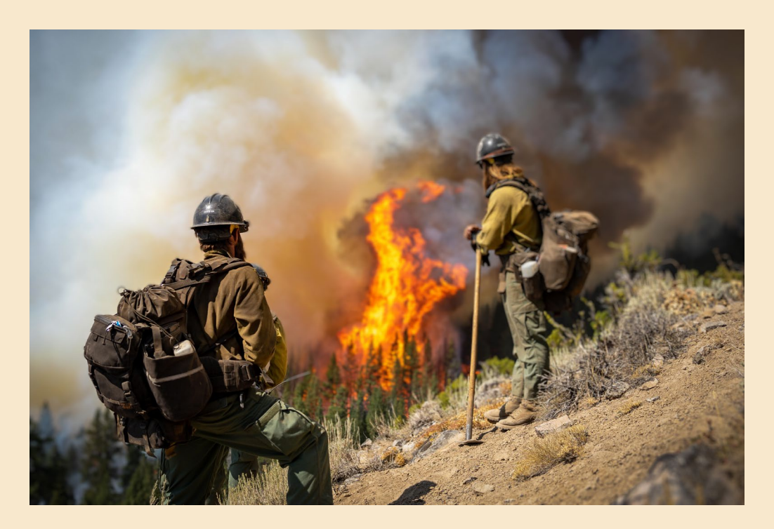
The Ruby Mountain Interagency Hotshot Crew monitors the fireline during the Dixie Fire on the Lassen National Forest.

The Interior Department is continuing efforts to transform its wildland fire workforce. The National Wildfire Coordinating Group (NWCG), responsible for federal wildland firefighter training, received Bipartisan Infrastructure Law funding to create a performance-based training system to further develop professional wildland firefighters.