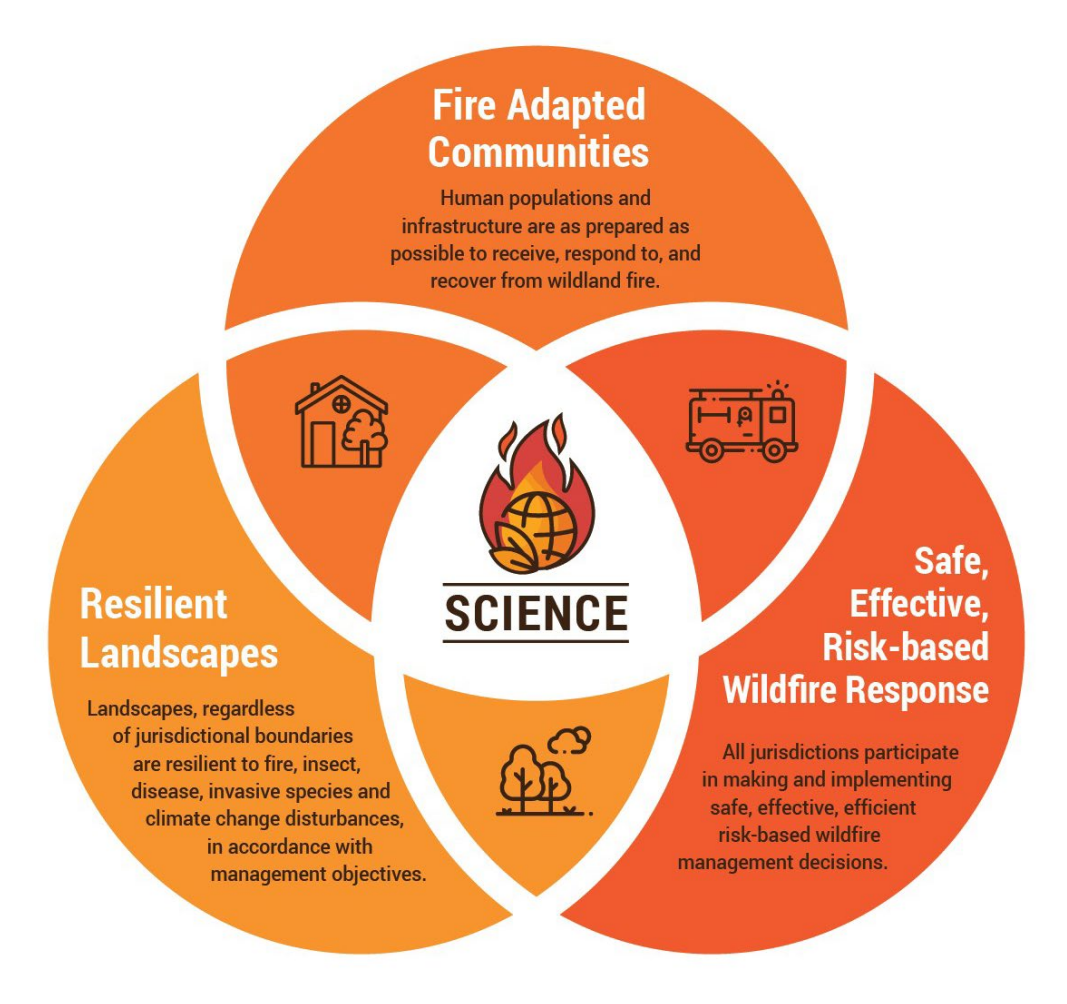
Diagram of the vision and goals of the National Cohesive Wildland Fire Management Strategy

The National Cohesive Wildland Fire Management Strategy , developed in 2014 and updated in 2023, establishes a national vision for wildland fire management. It represents a commitment to working collaboratively among all stakeholders and across all landscapes through shared stewardship to achieve three national goals: