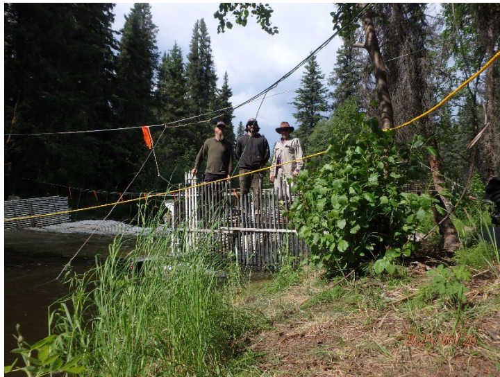
Tanada Creek Salmon Weir, 2024