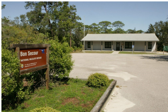
Bon Secour National Wildlife Refuge.

The Bon Secour National Wildlife Refuge encompasses some of Alabama's last remaining undisturbed coastal barrier habitat and protects many federally endangered and threatened species as well as migratory birds. The Bon Secour Headquarters Office and Maintenance buildings have reached the end of their life expectancy, have significant water damage and air quality issues, and no longer meet the operational needs of the refuge. GAOA LRF will replace the buildings with a consolidated single facility, improving employee and visitor experience to better meet the refuge's needs.