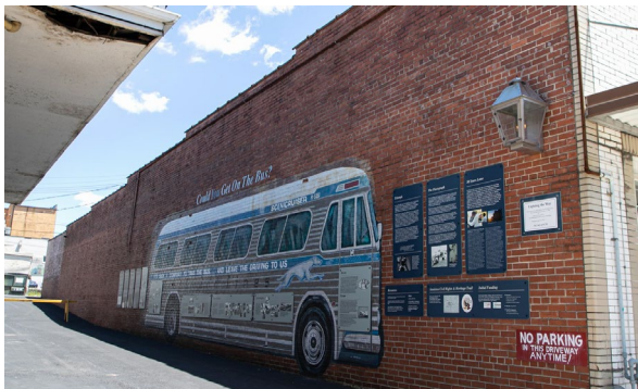
Greyhound Bus Depot and Mural Building.

Freedom Riders National Monument, Birmingham Civil Rights National Monument