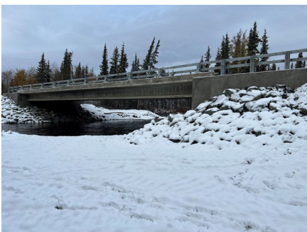
New Sourdough Campground Bridge.

Sourdough Campground in Alaska is the end point for travels on the Gulkana Wild and Scenic River, one of the most popular rivers in the state for its abundant wildlife and water-based recreational activities. This project replaced the Sourdough Campground bridge, which provides sole access to the boat launch that is the take-out for fishing on an isolated portion of the river. The previous bridge was functionally obsolete, structurally deficient, and restricted because it cannot carry highway legal loads. The bridge replacements will prevent bridge failure and restore access to the boat launch.