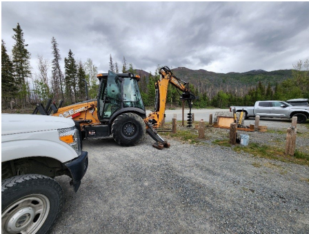
Construction at Kenai National Wildlife Refuge.

Kenai National Wildlife Refuge is known for its diverse ecosystems including ice fields, glaciers, tundra, forests, and coastal wetlands. While these public lands provide visitors with the opportunities to engage in recreational activities, rehabilitation is needed for the site's cabins, outdoor education facilities, and more. This project also repairs transportation assets such as roads and parking areas and mends pedestrian and vehicle recreation access points.