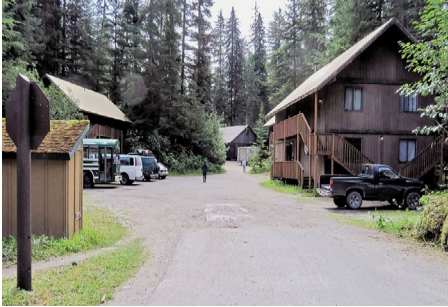
Current housing at Glacier Bay National Park & Preserve.

Glacier Bay National Park and Preserve encompasses 3.3 million acres of rugged mountains, dynamic glaciers, temperate rainforest, wild coastlines, and deep sheltered fjords in Alaska's Inside Passage. The park's current apartments are undersized and in such poor condition that they were slated for demolition and replacement in 2005. Staff overflow have been living in the Glacier Bay Historic Lodge in rooms intended for guest rental. This project demolishes and replaces apartment buildings and replaces buried fuel and propane lines that are at risk of leakage. New buildings will house more employees, leaving the existing Lodge units available for guest rental.