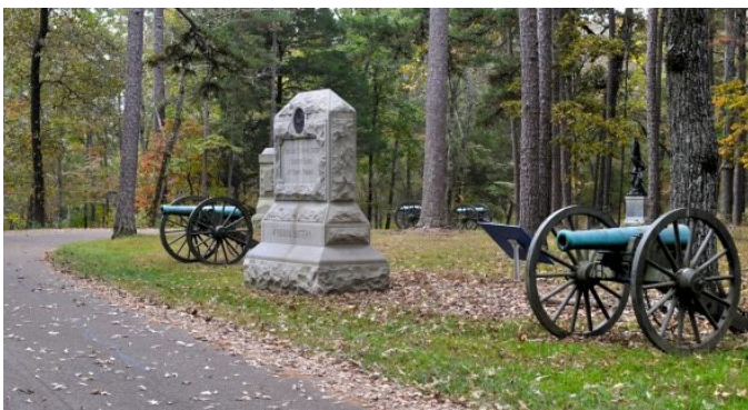
The Chickamauga and Chattanooga National Military Park.

The Chickamauga and Chattanooga National Military Park commemorates two major battles of the American Civil War. The current roads, which follow transportation routes used during the 1863 Battle of Chickamauga, have reached the end of their lifecycle, creating dangerous driving conditions. This project will repair, rehabilitate, and reconstruct deteriorating roads and parking areas, including resurfacing pavement, stabilizing shoulders, and repairing drainage structures to enable the long-term preservation of the military park and provide safer conditions for park visitors.