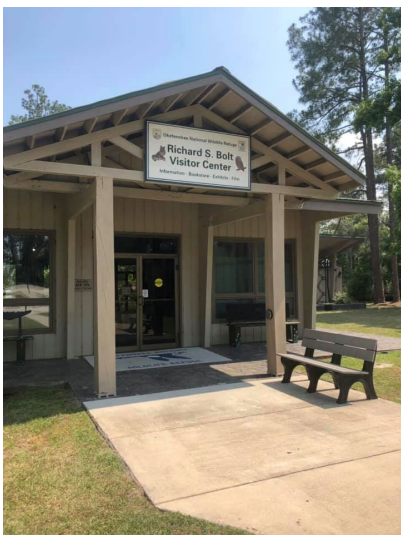
Okefenokee National Wildlife Refuge Visitor Center.

The Okefenokee National Wildlife Refuge, world renowned for its amphibian populations, is the headwaters of the Suwannee and St. Marys rivers and provides habitat for threatened and endangered species. This project will provide additional funding for the replacement of the Administrative Headquarters and Visitor Center facility, which was energy inefficient and showed significant signs of age, wear, and deterioration. This project will reduce annual operations and maintenance cost and improve visitor experience.