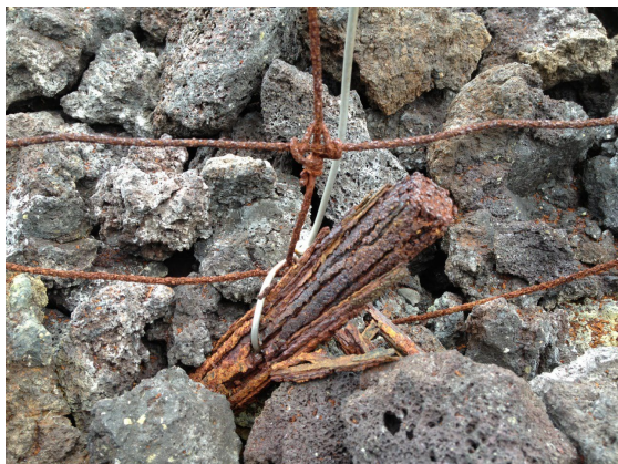
Corroded fence anchor at Hawai'i Volcanoes National Park

Haleakalā National Park, Hawai'i Volcanoes National Park, Kalaupapa National Historical Park