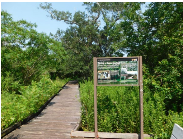
Trail signage at Bayou Sauvage National Wildlife Refuge.

The Bayou Sauvage Urban National Wildlife Refuge is an urban refuge located within the city of New Orleans, offering recreation opportunities including fishing, crabbing, hiking, bird watching, and environmental education. The refuge's Ridge Trail Boardwalk provides important educational opportunities and is a centerpiece for community involvement but is at risk of being closed to the public due to disrepair. This project will replace the Ridge Trail Boardwalk and Pavilion, rejuvenating visitation and volunteerism at this site. The project will also replace the Big Branch Marsh National Wildlife Refuge Wastewater Treatment System which is 90% inefficient and will pose an environmental hazard if not properly repaired. These replacements are critical for visitor safety and experience while visiting the refuge.