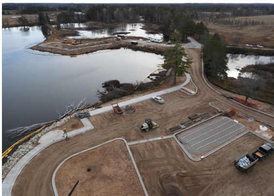
Aerial view of repairs at Seney National Wildlife Refuge.

Seney National Wildlife Refuge spans over 95,000-acres of refuge, breeding ground, and sanctuary for migratory birds, fish, and plant habitat. The visitor center and office buildings at the refuge have aged beyond their useful life and no longer adequately support visitation. This project will replace the buildings with one collocated, energy efficient facility to provide an improved visitor experience. The project also will replace parking areas, resurface the entrance road, and rehabilitate the Pine Ridge Nature Trail.