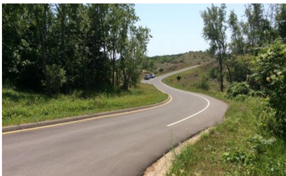
Paved road at Sleeping Bear Dunes National Lakeshore.

Pictured Rocks National Lakeshore and Sleeping Bear Dunes National Lakeshore offer a beautiful four-season landscape of sandstone cliffs, beaches, and waterfalls for visitors to explore. The parks' main roads and parking units are deteriorating and create potential safety hazards as well as damage to park and visitor vehicles. This project applies a variety of asphalt treatments to the paved areas, including crack sealing, chip sealing, and patching in order to extend paved surface life, decrease park maintenance activities, and eliminate safety hazards.