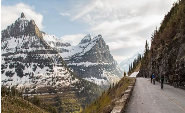
Bikers enjoying Going-to-the-Sun Road.

Glacier National Park, named for the powerful glaciers that carved the landscape during the last ice age, showcases various alpine meadows, carved valleys, and spectacular lakes. This project rehabilitates two major roads, including the reconstruction of 9.3 miles of the Going-to-the-Sun Road, which is the primary roadway that park visitors use to access and enjoy the park's scenic views. Improvements include widening the road's curves, and changes to the pavement's friction and traffic control and safety. This project will also demolish and replace McDonald Creek's bridge that services several visitor access points, a ranger station, and landowner residences. This project will extend the life of the road, improve safety, and help ensure continued access for visitors at the park.