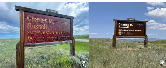
Old and new refuge signs. Photo Credits: USFWS

Charles M. Russell National Wildlife Refuge, Lee Metcalf National Wildlife Refuge