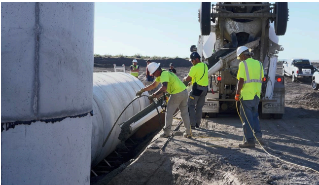
Grub Reservoir during construction.

Grub Reservoir in Montana provides a consistent source of water to control wildfires and has a riparian area that supports wildlife habitat and wildlife-dependent recreation. Grub Dam's aging infrastructure posed a safety risk for staff, the public, and downstream roads and grazing allotments. This project removed and replaced an existing steel outlet works with a reinforced concrete outlet works, which allows for the controlled release of water from the dam. By rehabilitating the dam, this project mitigates future dam failure, protecting staff, residents, and local wildlife habitats.