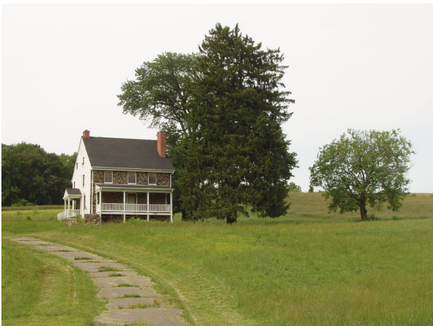
Ramsey House at First State National Historical Park.

First State National Historical Park is made up of sites spread throughout Delaware and Pennsylvania that preserve and protect early Dutch, Swedish, and English settlements and commemorates the role Delaware played in the birth of the United States as the first State to ratify the Constitution. The historic 1830s Ramsey House and the Ramsey Barn in Brandywine Valley have deteriorated and are currently closed to the public. This project will restore the Ramsey House and the Ramsey Barn foundation ruins while rehabilitating the site's entrance drive and parking area. When the restored house and barn foundation ruins are open to the public, they will enable park staff to convey stories of the Brandywine Valley. Site rehabilitation efforts associated with the entrance drive and parking lot will protect and improve wildlife habitat.