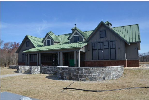
Coastal Delaware National Wildlife Refuge Visitor Center.

The Coastal Delaware National Wildlife Refuge Complex, which includes Bombay Hook and Prime Hook National Wildlife Refuges, protects one of the largest remaining expanses of tidal salt marsh habitats in the mid-Atlantic region and is home to migratory birds, horseshoe crabs, and terrapins. Current buildings at these locations have serious maintenance issues, including foundation issues, substantial energy inefficiencies, and poor conditions that would require full replacement of all utility infrastructure. This project replaced the geographically dispersed deteriorating facilities at Bombay Hook National Wildlife Refuge with a new Headquarters and Visitor Center facility. At Prime Hook National Wildlife Refuge, this project will replace the visitor contact station and a multi-purpose building that will include office space, visitor orientation, exhibition space, and classrooms. These new facilities will be safer, more efficient, and promote public engagement and natural resource education.