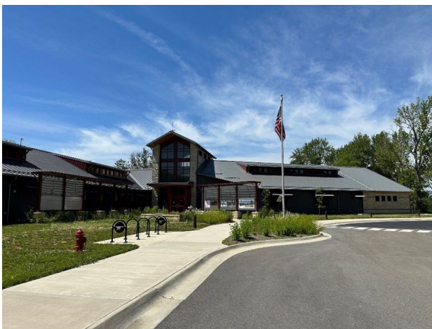
Newly constructed Crab Orchard Visitor Center.

Crab Orchard National Wildlife Refuge spans 44,000 acres of diverse habitats and offers recreation including hiking, canoeing, hunting, camping, picnicking, photography, and birdwatching. The Refuge had leaking water and sewer lines, a visitor center that is beyond its useful lifecycle, and outdated campground facilities. This project repairs or replaces waterlines and sewer lines, has replaced the visitor center with a modern facility, and modernizes campground facilities and related outdoor recreation facilities including shower buildings, water lines, campgrounds, and campground roads. This will make the refuge safer and more attractive to visitors, while saving the facility thousands of dollars in lost revenue from leaks. Future GAOA LRF projects will address the high hazard dams located at the Refuge.