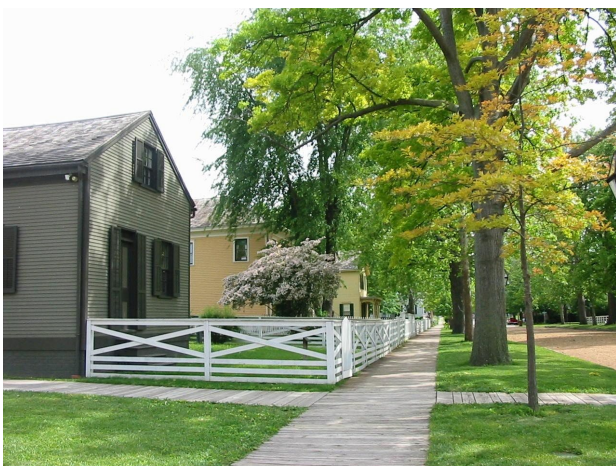
Wooden boardwalk sidewalk outside the Arnold House.

Lincoln Home National Historic Site, located in in Springfield, IL, preserves and protects the only home ever owned by President Abraham Lincoln and its surrounding neighborhood. The existing pavement surfaces, which are comprised of brick, wooden boardwalk, and asphalt, have deteriorated and are prone to frequent shifting and buckling. This project will replace deteriorating pavement along streets, parking areas, and walkway surfaces in order provide accessible pedestrian routes. Following completion of this work, wheelchairs and other mobility assistance devices will be able to traverse smooth, firm, and properly graded pavement surfaces. This project will provide for a more enjoyable and safe pedestrian experience for all visitors and staff.