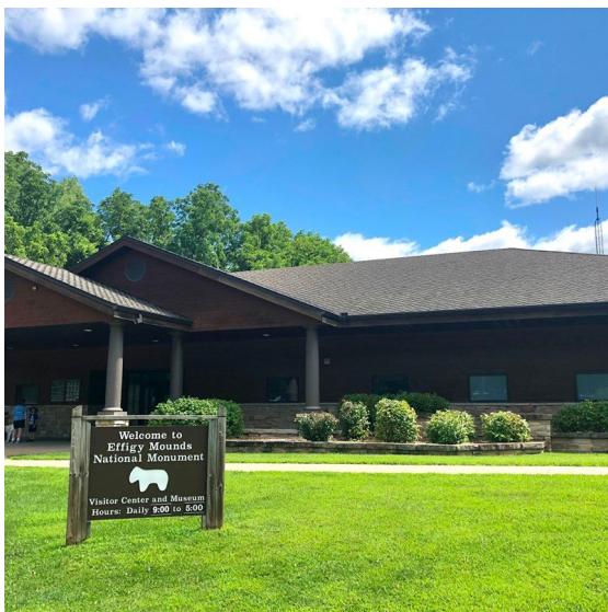
Current Effigy Mounds National Monument Visitor Center.

Effigy Mounds National Monument protects significant prehistoric earth mounds built by American Indians and protects wildlife, scenic, and other natural values of the area. The Visitor Center is outdated, inaccessible, and its structural integrity is degrading. This project will renovate the visitor center and grounds, improving structural integrity, addressing code deficiencies, increasing energy efficiency, and improving accessibility. This work will make the Visitor Center safer for staff and visitors and improve interpretation and education opportunities.