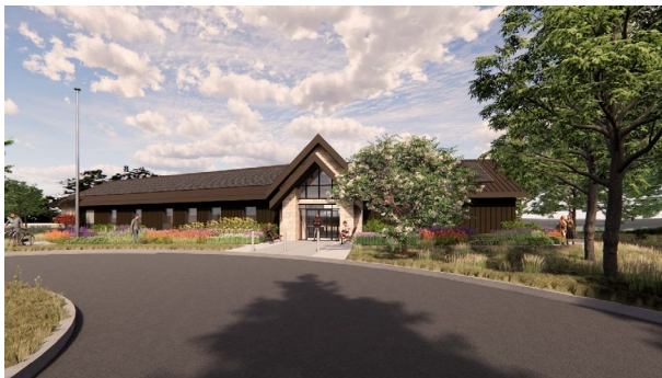
Rendering of the New Administrative Headquarters at the Luster Heights, Iowa site.

Upper Mississippi River National Wildlife and Fish Refuge