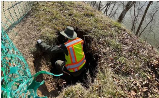
Sinkhole repairs along the Potomac River.

Chesapeake and Ohio Canal National Historical Park