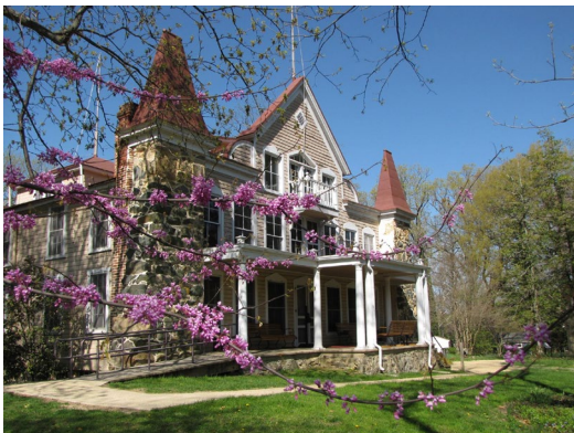
Clara Barton House.

The Clara Barton National Historic Site honors Clara Barton, humanitarian and founder of the American Red Cross, and her home, which served as the first American Red Cross headquarters. The Clara Barton House was built in 1891, and public visitation is restricted due to safety concerns of failing and outdated systems. This project will rehabilitate the house by repairing the exterior, making structural repairs to the second and third floors, improving accessibility, and replacing the site’s heating and cooling, electrical, and plumbing systems. This project will protect this historic structure and its features providing a safe experience for visitors and staff.