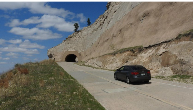
Summit Road at Scotts Bluff National Monument.

Built in the 1930's, the Summit Road is the oldest concrete road in the state of Nebraska and gives visitors a chance to reach the top of Scotts Bluff by automobile. This project will rehabilitate sections of the Summit Road and parking areas, which are deteriorating. Work includes replacing deteriorated sections, removing and replacing old expansion joint caulking, and repairing the retaining wall to match the existing structure. The project will also relocate the gate at the visitor center to provide enhanced security from oversized vehicles entering the tunnels and causing damage. Road repairs will improve visitor experience and provide continued access to the bluff vista and visitor center.