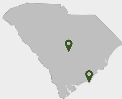
GAOA LRF Projects

With the full five years of funding, GAOA LRF will invest over $42.4 million towards improving over 20 assets at 2 projects in South Carolina.