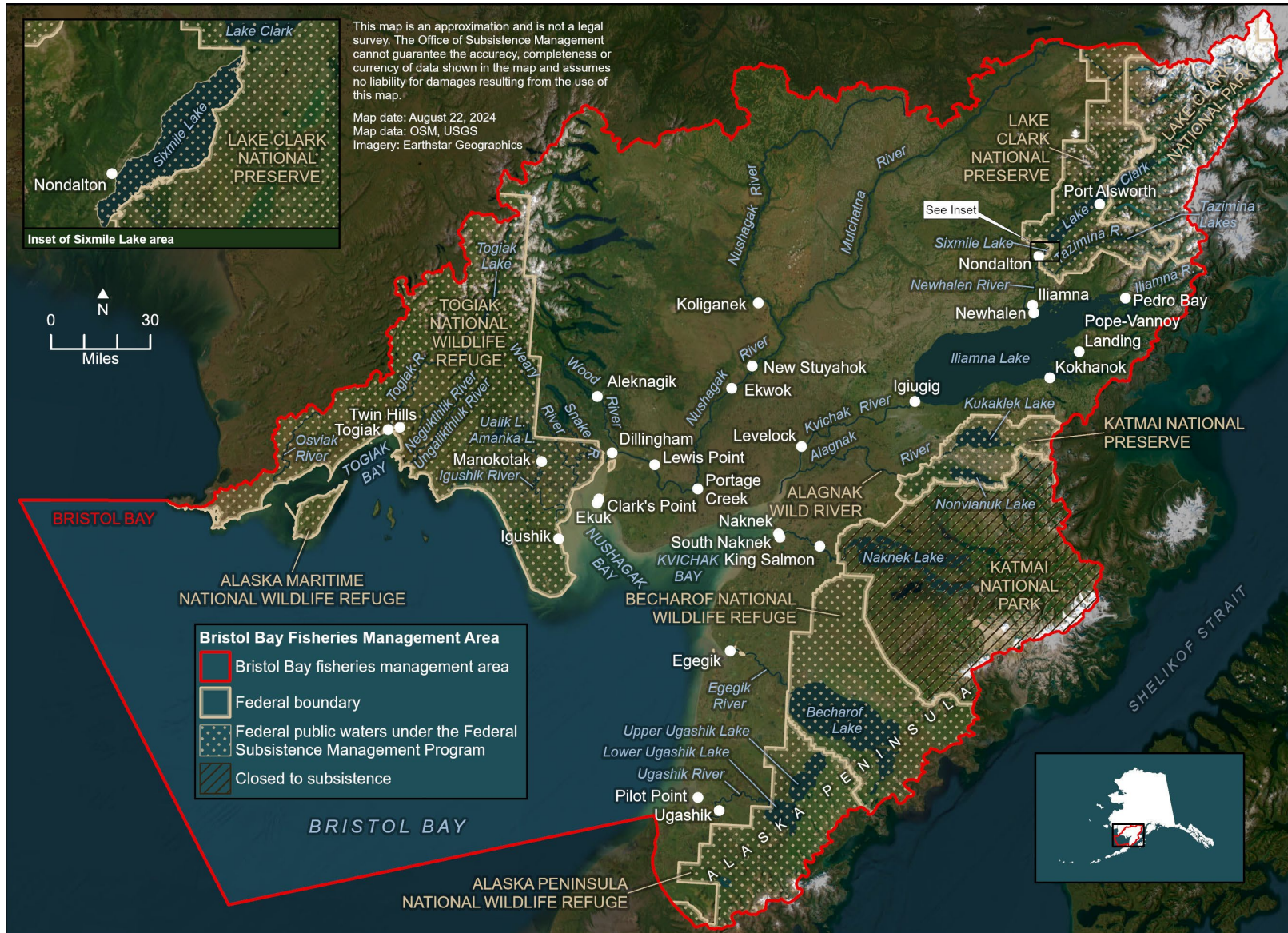
Figure 1. Federal public waters of the Bristol Bay Fisheries Management Area.