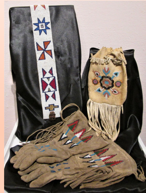
Beaded Belt, Beaded Buckskin Bag and Beaded Gauntlet Gloves

Donated to the Museum of the Plains Indian