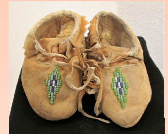
Beaded Buckskin Baby Moccasins

Donated to the Museum of the Plains Indian