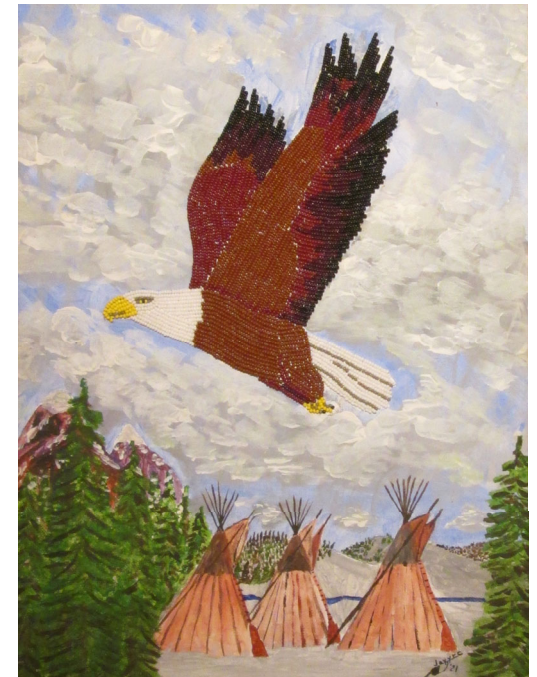
Piita Beaded image on acrylic canvas painting, Jay Young Running Crane, Blackfeet