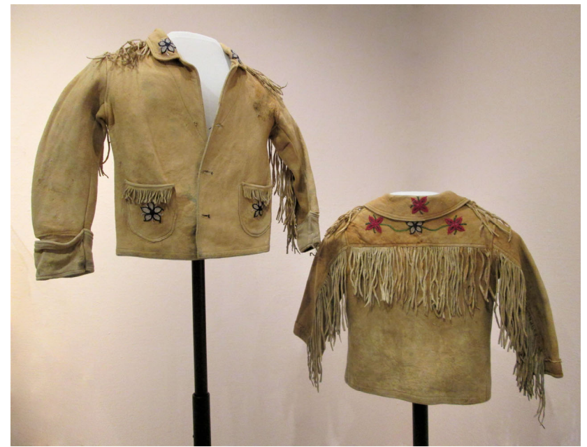
Beaded Buckskin Child Jackets with matching floral designs (Possibly belonging to twins) Donated to the Museum of the Plains Indian