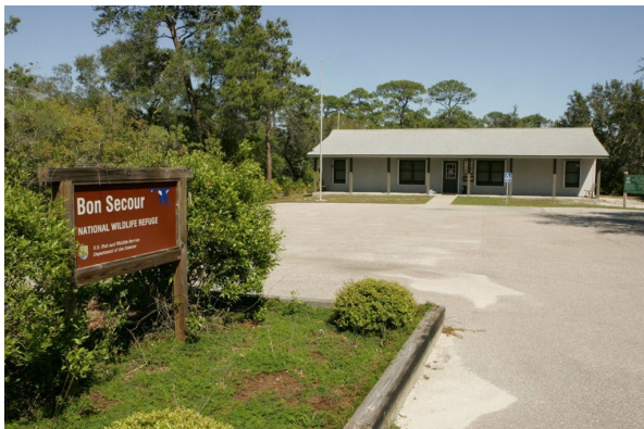
Bon Secour National Wildlife Refuge.

The Bon Secour National Wildlife Refuge encompasses some of Alabama's last remaining undisturbed coastal barrier habitat and protects many federally endangered and threatened species as well as migratory birds. The Bon Secour Headquarters Office and Maintenance buildings have reached the end of their life expectancy; they have significant water damage and air quality issues and no longer meet the operational needs of the refuge. GAOA LRF will replace the buildings with a consolidated single facility, improving employee and visitor experience to better meet the refuge's needs.