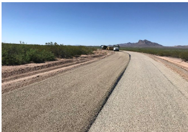
Haekel Road under repair.

Haekel Road is an asphalt road that provides access to Hot Well Dunes Recreation Area, which attracts thousands of off-highway vehicle enthusiasts every year. The road had potholes, rutting, and spalling, all of which posed a serious safety risk and could have caused the road to become unusable. This project repaired the road surface and subgrade to resolve road safety issues and provide visitors and employees with safe access to the popular recreation area.