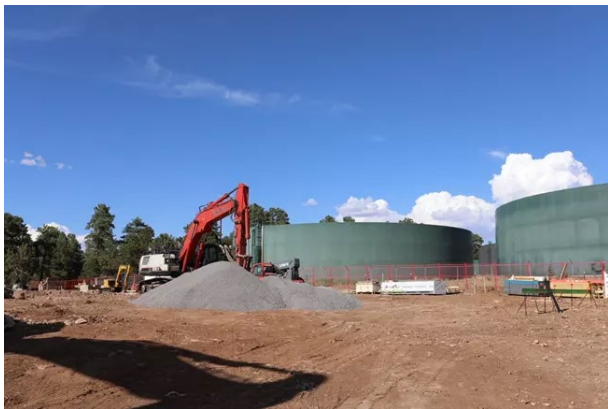
South Rim Wastewater Plant.

Grand Canyon National Park, considered one of the Natural Wonders of the World, is an immense, 277-mile-long canyon bisected by the Colorado River. The 1970s-era South Rim Wastewater Treatment Plant equipment and processes are outdated, inefficient, and overloaded. This project will replace the South Rim Wastewater Treatment Plant with a new plant that is able to efficiently process peak season wastewater demands, minimizing emergency repairs and helping to ensure safety for visitors, staff, and residents. The project will also upgrade the new control building with modern code-compliant HVAC and electrical systems, fire alarms and fire suppression systems, and modern wastewater processing equipment.