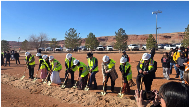
Groundbreaking on the Many Farms High school campus.

Many Farms High School, located in the heart of the Navajo Nation in Arizona, serves students from 9th grade through 12th grade. This project is consolidating current education programs housed in multiple buildings on the campus into a single, energy-efficient facility to create a safe and positive environment conducive to learning. The project is also improving security systems, installing new perimeter fencing, expanding parking, and improving accessibility.