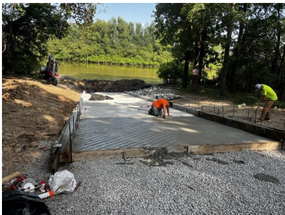
Construction on a boat launch at Dale Bumpers White River National Wildlife Refuge.

Dale Bumpers White River National Wildlife Refuge is one of the most critical areas for wintering waterfowl in North America, and home to the only population of native black bears in the state. This project is repairing boat launches, rehabilitating campgrounds, and repairing levees that provide waterfowl with critical habitat and visitors with access to viewing platforms. In addition, this project is repairing numerous public transportation assets, including parking lots, road bridges, and gravel roads that enable visitor access. These repairs will improve accessibility and visitor experience at the refuge.