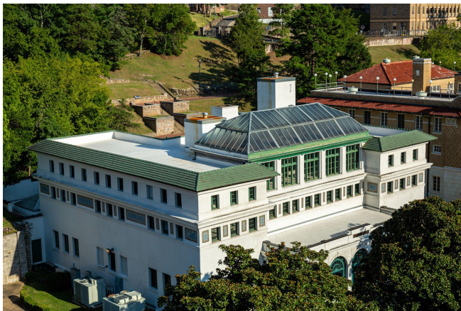
Historic Bathhouse at Hot Springs National Park.

Hot Springs National Park is renowned for its ancient thermal springs and offers nine historic Victorian bathhouses enjoyed by visitors for hundreds of years. However, some of the historic bathhouses have been declining and vacant for years. This project will rehabilitate critical building systems in the long-vacant Maurice and Libbey Bathhouses, as well as the Buckstaff Bathhouse, protecting and preserving these significant historic structures. Completing the initial set of repairs to the bathhouses will enable revenue generation opportunities, sustainable adaptive reuse of the buildings, and public use and enjoyment of the natural hot springs and bathhouses for generations to come.