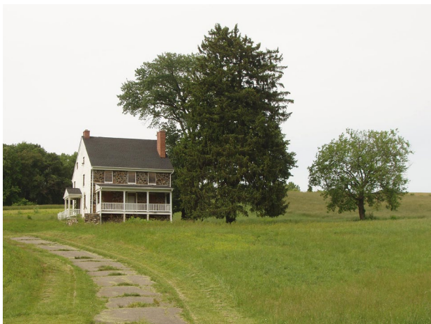
Ramsey House at First State National Historical Park.

First State National Historical Park is made up of sites spread throughout Delaware and Pennsylvania that preserve and protect early Dutch, Swedish, and English settlements and commemorates the role Delaware played in the birth of the United States as the first State to ratify the Constitution. The historic 1830s Ramsey House and the Ramsey Barn in Brandywine Valley have deteriorated and are currently closed to the public. This project will restore the Ramsey House and the Ramsey Barn foundation ruins while rehabilitating the site's entrance drive and parking area. When the restored house and barn foundation ruins are open to the public, they will enable park staff to convey stories of the Brandywine Valley. Site rehabilitation efforts associated with the entrance drive and parking lot will protect and improve wildlife habitat.