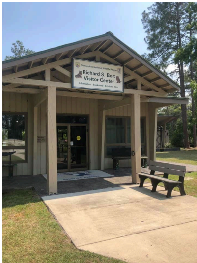
Okefenokee National Wildlife Refuge Visitor Center.

The Okefenokee National Wildlife Refuge, world renowned for its amphibian populations, is the headwaters of the Suwannee and St. Marys rivers and provides habitat for threatened and endangered species. This project is replacing the Administrative Headquarters and Visitor Center facility, to provide increased recreational, educational, and sportsman access opportunities.