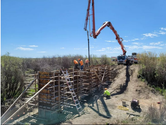
Construction at Camas NWR.

Camas National Wildlife Refuge spans approximately 11,000 acres of sweeping mountain views and recreation including photography and birding. The water delivery systems at Camas were built in the 1960s when Camas Creek typically ran every year and water flowed freely from artesian wells. Changes in local agricultural practices altered the hydrology of the area, making it difficult to manage water effectively for migratory birds and other wildlife. This project is relocating wells closer to productive wetlands, rehabilitating open water delivery ditches, improving wetlands within the waterfowl hunting area, restoring riparian areas, and improving public use facilities.