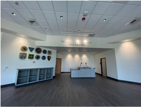
Jack F. Wilson building after repairs.

The Jack Wilson Headquarters building, located at the National Interagency Fire Center (NIFC) campus in Idaho, is essential to the operation of NIFC fire management programs. The building needed numerous replacements and repairs to continue effectively supporting wildland fire management. This project repaired floor and ceiling tiles, wall coverings, failing HVAC components, and the office suite. This project also brought the electrical system into code compliance and replaced the lighting with LED fixtures. This project has improved the working environment for NIFC staff and extended the lifespan of critical building components.