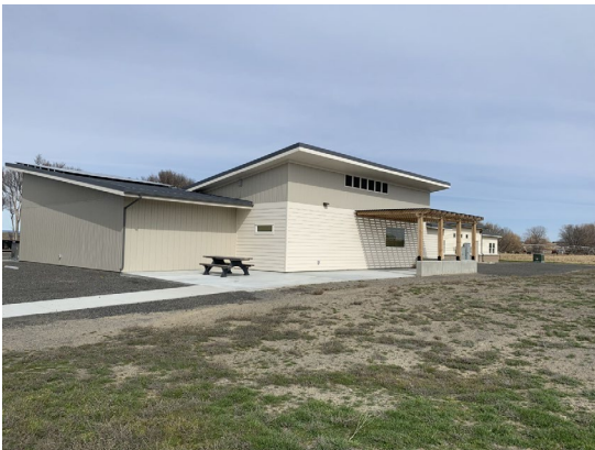
Craters of the Moon National Monument and Preserve.

Idaho's national parks protect natural and historic sites, including volcanic formations at Craters of the Moon National Monument and Preserve, Pliocene fossils at Hagerman Fossil Beds National Monument, and a World War II Japanese American incarceration site at the Minidoka National Historic Site. The project will address facility deficiencies at each of these sites, such as installing energy efficient utility systems, updating fire safety and suppression systems, and upgraded maintenance facilities and equipment. This work will improve safety, protect resources and assets, and allow the parks to continue mission-critical work.