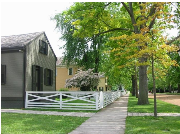
Wooden boardwalk sidewalk outside the Arnold House.

Lincoln Home National Historic Site, located in Springfield, IL, preserves and protects the only home ever owned by President Abraham Lincoln and its surrounding neighborhood. The existing pavement surfaces, which are comprised of brick, wooden boardwalk, and asphalt, have deteriorated and are prone to frequent shifting and buckling. This project will replace deteriorating pavement along streets, parking areas, and walkway surfaces in order to provide accessible pedestrian routes. Following completion of this work, wheelchairs and other mobility assistance devices will be able to traverse smooth, firm, and properly graded pavement surfaces. This project will provide for a more enjoyable and safe pedestrian experience for all visitors and staff.