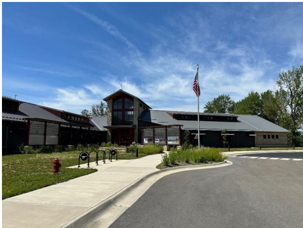
Newly constructed Crab Orchard Visitor Center.

Crab Orchard National Wildlife Refuge spans 44,000 acres of diverse habitats and offers recreation including hiking, canoeing, hunting, camping, picnicking, photography, and birdwatching. The refuge had leaking water and sewer lines, a visitor center that was beyond its useful lifecycle, and outdated campground facilities. This project is repairing or replacing waterlines and sewer lines, has replaced the visitor center with a modern facility, and is modernizing campground facilities and related outdoor recreation facilities including shower buildings, water lines, campgrounds, and campground roads. This will make the refuge safer and more attractive to visitors, while saving the facility thousands of dollars in lost revenue from leaks.