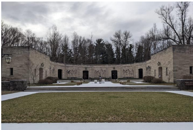
Lincoln Boyhood National Memorial Visitor Center.

GAOA LRF is funding Maintenance Action Teams (MATs) in the National Park Service and U.S. Fish and Wildlife Service. MATs are teams of federal employees who can quickly mobilize across their region to complete smaller scope repair, demolition, rehabilitation, or historic preservation activities.