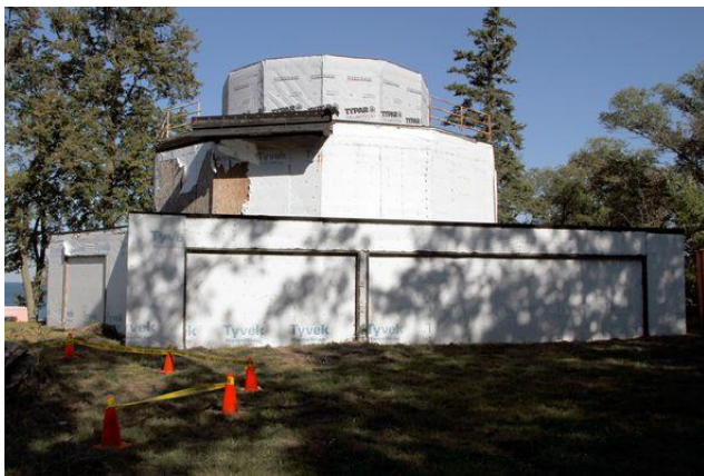
House of Tomorrow renovations in progress.

Indiana Dunes National Park, home to shifting sand dunes and significant plant and bird diversity along the coast of Lake Michigan, offers recreation such as beachgoing, swimming, fishing, horseback riding, hiking, and cross-country skiing. Many of the historic facilities at the park have been closed to the public for several years due to structural instability and unsafe conditions. This project is completing historic rehabilitation on the popular and significant historical structures at the Bailly Homestead, Good Fellow Camp, and the House of Tomorrow. These repairs will enable educational programming and eventually reopen structures to the public. The project is also improving water and wastewater systems, moving power lines underground, and incorporating modernized technology to increase energy efficiency.