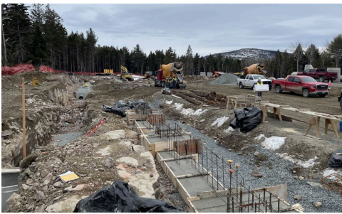
Construction of new maintenance facility.

Acadia National Park, one of the top 10 most-visited national parks, protects the highest rocky headlands along the Atlantic coastline, a variety of habitats, and rich heritage. This project is constructing a new maintenance operations facility and demolishing the existing facilities, which were substantially undersized; did not meet fire, accessibility, or code requirements; and posed a safety threat to employees. The project is also demolishing more than 20,000 square feet of unsafe park structures and returning the sites to their natural conditions. The new maintenance facility will equip the park with workshops, equipment storage, meeting rooms, and offices.