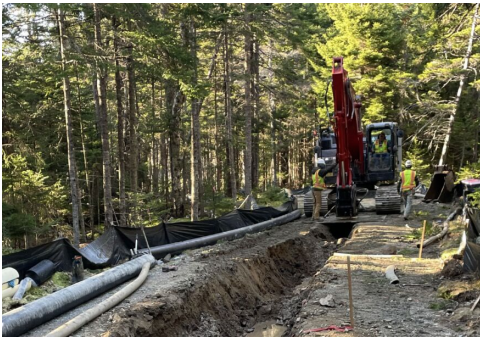
Waterline installation in Acadia National Park, now complete.

The Schoodic District, located within Acadia National Park, is the only part of the park found on the mainland. This project rehabilitated the Schoodic Point potable water and wastewater systems. While over 250,000 visitors use these facilities each year, the 1970s-era water systems were in dire need of repairs. The improved systems reduce the risk of environmental contamination and improve the consistency of water availability. The project also replaced wastewater collection lines, reconstructed wells, and implemented systems to reduce the potential for freezing.