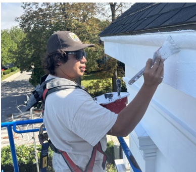
Exterior painting of Rockland Visitor Center.

GAOA LRF is funding Maintenance Action Teams (MATs) in the National Park Service and U.S. Fish and Wildlife Service. MATs are teams of federal employees who can quickly mobilize across their region to complete smaller scope repair, demolition, rehabilitation, or historic preservation activities.