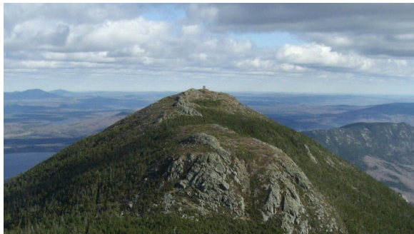
The Appalachian National Scenic Trail.