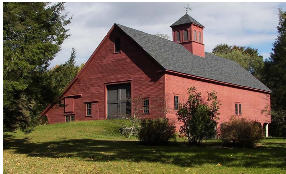
Blow-Me-Down Farm at Saint-Gaudens National Historical Park.

Saint-Gaudens National Historical Park features the home, studios, and gardens of Augustus Saint-Gaudens, one of America's greatest sculptors. Historic buildings at the site have deteriorated and critical building systems require replacement to protect high value art collection from fire, theft, and damage. This project will replace mission-critical fire and security systems, update electrical infrastructure, replace the HVAC system, and modify facilities to meet accessibility standards. Work also includes rehabilitating historic structures to serve as a center for the arts and support future leasing opportunities. The buildings will be more reliable, resilient, and energy efficient, providing safe and comfortable facilities for staff and visitors.