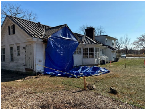
In progress building addition to Fenske Visitor Center.

Great Swamp National Wildlife Refuge is a natural oasis located just 26 miles west of New York that has become an important resting and feeding area for more than 200 species of birds. Currently, staff at Great Swamp National Wildlife Refuge and Great Meadows National Wildlife Refuge are divided between the existing headquarters building and Fenske Visitor Center. The existing headquarters building is aging, expensive to operate, and limits opportunities for engagement with the public. This project is consolidating refuge management functions by constructing an addition to the Fenske Visitor Center that will provide office space for staff and volunteers and a larger multi-purpose room. Consolidating facilities into a single location will provide staff more opportunities to engage with the public and improve the visitor experience.