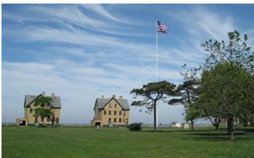
Fort Hancock at Gateway National Recreation Area.

Fort Hancock at Gateway National Recreation Area once protected New York Harbor from invasion by sea and now allows visitors to tour gun batteries and the historic military post. The current water distribution system at Fort Hancock is failing and suffers from leakage, high maintenance cost, and poor reliability, which is exacerbated by storm surges. This project is rehabilitating the wastewater system by removing antiquated underground lines, disposing of unnecessary equipment, and restoring percolation beds. This project also rehabilitates the potable water distribution systems at Sandy Hook. Project work is improving operational efficiency, helping ensure capacity for fire protection, and lowering the risk of environmental damage.