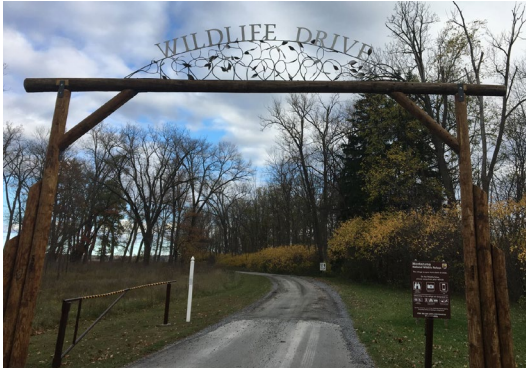
Wildlife Drive at Montezuma National Wildlife Refuge.

Montezuma National Wildlife Refuge is a critical migration and nesting habitat for over 300 species of birds and provides visitors with recreational opportunities for bird watching, educational programs, and nature photography. Currently, the refuge uses multiple older buildings that fail to provide adequate office, storage, and meeting space and have health and safety concerns with the structure, utilities, and other critical systems. This project will replace these buildings with a collocated and consolidated visitor center and administration facility. The replacement facility will facilitate mission-critical national resource protection, public use programs, and education by providing an office and meeting space for staff, volunteers, and large school groups.