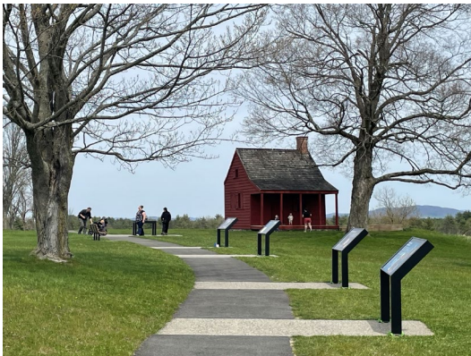
Completed trail rehabilitation with interpretive signs at Saratoga National Historical Park.

Saratoga National Historical Park preserves the sites associated with the 1777 Battles of Saratoga during the Revolutionary War. This project updated and rehabilitated worn interpretive waysides and routes, parking, and walkways to provide universal accessibility at all 10 tour stops along the Saratoga Battlefield Tour Road. Rehabilitation of components of the self-guided tour, including unsafe and deteriorating waysides, exhibits, and walkways, have improved visitor experiences, accessibility and safety, and reduced the need for corrective maintenance.