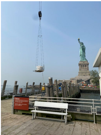
Crane lifting construction materials at Fort Wood.

Fort Wood, the base for the Statue of Liberty, is an eleven-pointed, star-shaped defensive fort built between 1808 and 1811. In recent years, the fort's walking surface has been in disrepair, unable to properly shed water and creating accessibility challenges for visitors. This project is addressing the ongoing deterioration and provides long-term protection to the terreplein and vertical surfaces of the fort. Work includes waterproofing the exterior levels of Fort Wood, preventing water infiltration, and replacing the walking surface to improve drainage, accessibility, and support heavily visited areas.