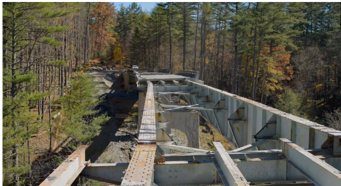
Blue Ridge Parkway's Laurel Fork Bridge under construction.

The Blue Ridge Parkway, spanning almost 500 miles across the crest of the Blue Ridge Mountains through North Carolina and Virginia, is the most visited NPS site in the country with more than 16.7 million visitors in 2023. This project is replacing the failing Laurel Fork Bridge in Ashe County, NC, originally built in 1939. The bridge was near the end of its lifespan and was often closed during major wind events due to safety concerns. The replacement bridge will provide safe, accessible, and continuous visitor access.