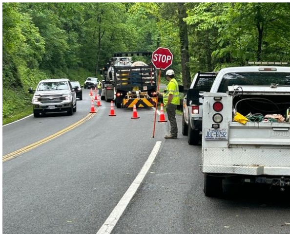
Road repair work at the Great Smoky Mountains National Park.

Great Smoky Mountains National Park encompasses over 800 square miles in the Southern Appalachian Mountains and is the most visited national park in the country. The roadway pavement has potholes, cracks, dips, and poor drainage. This project is repairing pavement, replacing guardrails, adding new road signs, and improving drainage. These repairs help ensure that the park's roads are safe and accessible to all.