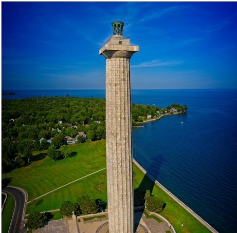
Aerial view of Perry's Victory & International Peace Memorial.

Perry's Victory and International Peace Memorial