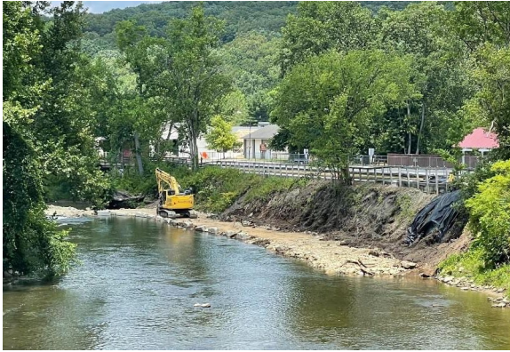
Riverbank stabilization construction in progress near the Towpath Trail.

Cuyahoga Valley National Park in Ohio preserves and reclaims the landscapes around the once highly polluted Cuyahoga River and provides visitors with recreational opportunities for scenic excursions on the Cuyahoga Valley Scenic Railroad and Towpath Trail. Erosion along the Cuyahoga riverbank is impairing the park's most popular trail and causing the loss of riverside vegetation and riparian habitat. This project is stabilizing eight sites on the riverbank and repairs eroded riverbank areas to reduce vegetation and habitat loss, reduce the need for emergency maintenance or trail closures, and help provide a safe and enjoyable trail experience for visitors.