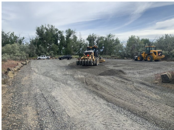
Cold Springs National Wildlife Refuge Parking Lot Repairs.

GAOA LRF is funding Maintenance Action Teams (MATs) in the National Park Service and U.S. Fish and Wildlife Service. MATs are teams of federal employees who can quickly mobilize across their region to complete smaller scope repair, demolition, rehabilitation, or historic preservation activities.