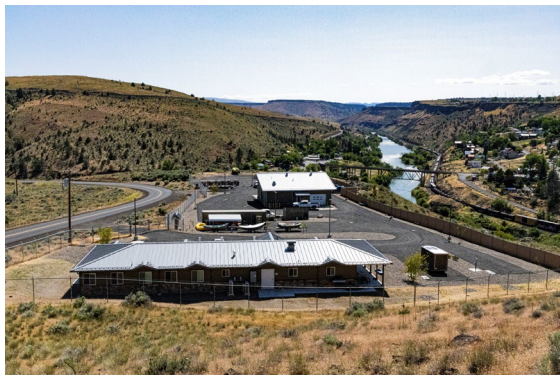
New Bakeoven Facilities in Maupin.

The BLM manages the Lower Deschutes Wild and Scenic River, which offers year-round river access for visitors to use the boat launches, day-use areas, and campgrounds. The staff and operations facilities that BLM utilizes to manage this area are based in Maupin. The existing buildings were outdated, not adequately sized or maintainable, and posed safety issues. This project demolished the deteriorating buildings at the site and replaced them a new office, workshop, and seasonal housing. These improvements will help improve safety for staff, provide adequate storage space, and assist with multi-jurisdictional coordination among partners for emergency response and services including wildland fire and search and rescue efforts.