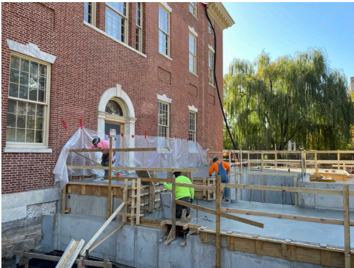
Repairs to the First Bank of the United States.

The First Bank of the United States, part of Independence National Historic Park in Philadelphia, operated between 1797-1811 after the Federal government adopted Alexander Hamilton's proposal to establish a national bank, laying the foundation of the U.S.'s financial systems. The bank is undergoing an extensive rehabilitation so it can reopen to the public for the first time since the 1970s, in time for the 250th anniversary of the signing of the Declaration of Independence in 2026. This project work is renovating the building's interior and exterior by replacing leaking metal roofing, stabilizing, cleaning, and repairing marble and brick masonry, correcting moisture incursion problems, and updating the electrical and HVAC systems.