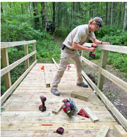
Trail bridge construction in progress at Erie National Wildlife Refuge.

GAOA LRF is funding Maintenance Action Teams (MATs) in the National Park Service and U.S. Fish and Wildlife Service. MATs are teams of federal employees who can quickly mobilize across their region to complete smaller scope repair, demolition, rehabilitation, or historic preservation activities.