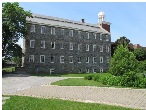
Wilkinson Mill.

Blackstone River Valley National Historical Park