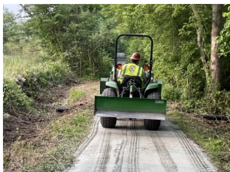
Trail resurfacing at Trustom Pond National Wildlife Refuge.

At Trustom Pond National Wildlife Refuge, MATs removed a deteriorating pole barn.