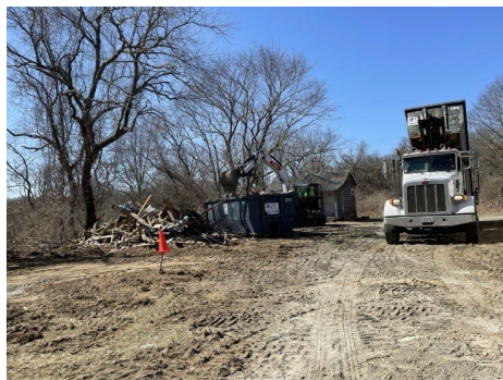
Demolition work at Trustom Pond National Wildlife Refuge.

GAOA LRF is funding Maintenance Action Teams (MATs) in the National Park Service and U.S. Fish and Wildlife Service. MATs are teams of federal employees who can quickly mobilize across their region to complete smaller scope repair, demolition, rehabilitation, or historic preservation activities.