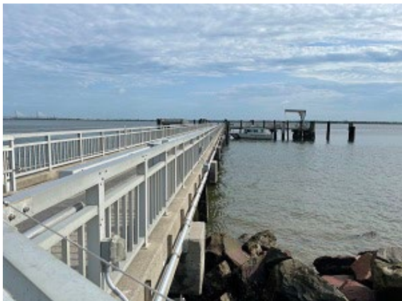
Dock at Fort Sumter and Fort Moultrie National Historical Park.

Fort Sumter and Fort Moultrie National Historical Park