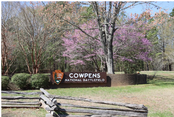
Entrance sign at Cowpens National Battlefield.

Congaree National Park, Cowpens National Battlefield, Kings Mountain National Military Park, Ninety Six National Historic Site