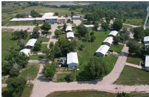
Aerial View of Wounded Knee District School.

Wounded Knee District School is an Oglala Lakota Sioux Nation school serving students from kindergarten through 8th grade. The existing campus is in poor condition and inadequate for current student and staff needs, which negatively impacts student learning capacity. This project will replace the existing campus with new, energy-efficient academic facilities. The project will provide students with a safe and functional learning environment, which will help improve their ability to learn and grow.