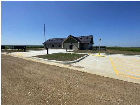
Completed headquarters building at Lake Andes National Wildlife Refuge.

Lake Andes National Wildlife Refuge is a critical wetland habitat for migratory birds and provides recreational opportunities for visitors including fishing, wildlife observation, and environmental education and interpretation. Due to flooding, some of the infrastructure at the refuge had been damaged beyond repair. This project is replacing the flood-damaged headquarters building; replacing trails, kiosks, a boat ramp, and observation deck; repairing damaged levees; and demolishing multiple excess buildings. These improvements will allow staff to administer environmental protection and public programming, increase access for employees and visitors, and support staff in carrying out the USFWS mission.