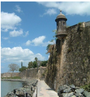
Cliff at San Fernando Bastion.

San Juan National Historic Site in Puerto Rico is a World Heritage Site protecting historic city fortifications. The cliff at San Fernando Bastion, which forms part of the foundation and support for the Castillo esplanade, is deteriorating and presents risks to the historic resource. This project is preventing further erosion and stabilizes the cliff, protecting this historic resource from harsh tropical weather conditions. Project work is correcting safety issues with falling rocks above the popular Paseo del Morro National Recreational Trail, which the park temporarily closed to visitors due to unsafe conditions. This project will restore and protect historic, cultural, and natural resources while protecting public safety.