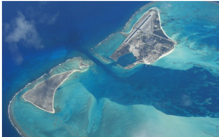
Aerial view of Midway Atoll National Wildlife Refuge.

The Midway Atoll National Wildlife Refuge, one of the largest marine conservation areas in the world, is a sanctuary for millions of seabirds, shorebirds, and various marine life. The existing sewage treatment system has frequent component failures and could cause ecosystem damage if it were to leak. This project will remove and replace the existing sewage treatment system with a properly sized system that will have improved functionality, improving health and safety for staff and wildlife on the island.