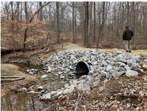
Completed culvert replacement at Meadowood Special Recreation Management Area.

The Meadowood Special Recreation Management Area offers opportunities for hiking, horseback riding, mountain biking, and enjoying wildlife in 800 acres of forest and meadows just outside of Washington, D.C. This project replaced deteriorated fencing, provided safe boundaries for the public, and protected resources. The project also replaced a deteriorating culvert and removed the former visitor center, which was a significant safety hazard. These repairs improved resource protection and provide safer experiences for visitors and employees.