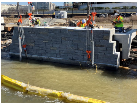
Rehabilitation of the Tidal Basin seawall.