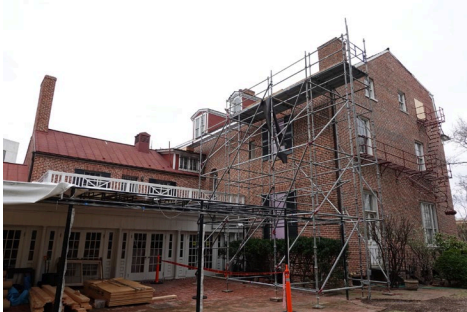
Repairs to Belmont-Paul Women’s Equality National Monument.