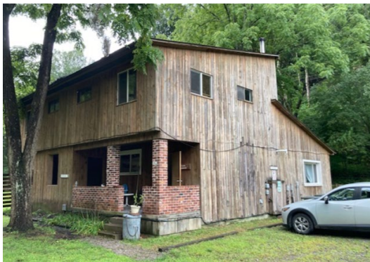
Building slated for demolition at New River Gorge National Park.

New River Gorge National Park and Preserve