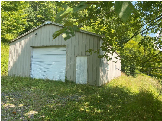
The Schaeffer Building prior to replacement.