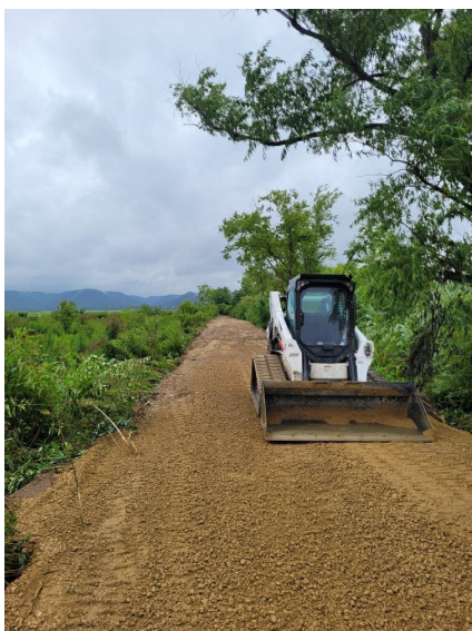
Trail at Trempealeau National Wildlife Refuge under construction.

GAOA LRF is funding Maintenance Action Teams (MATs) in the National Park Service and U.S. Fish and Wildlife Service. MATs are teams of federal employees who can quickly mobilize across their region to complete smaller scope repair, demolition, rehabilitation, or historic preservation activities.