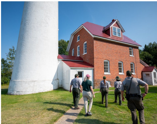
Outer Island at Apostle Islands National Lakeshore.

Apostle Islands National Lakeshore is a remote archipelago in Lake Superior known for its unique geology, the largest concentration of lighthouses in the country, and its historic and archeological resources. The Outer Island Dock, the main access point to Outer Island, was constructed in 1958 and has structural integrity concerns and is beyond its lifespan. This project is rehabilitating the dock to address deficiencies with dock stabilization and the base materials. Project work is also improving the tram connection that facilitates safe transportation of materials and supplies from the dock to light station and replacing the stone protection along the dock's perimeter. These improvements will help ensure the dock can support emergency response, visitor access, light station maintenance, and park operations for many years to come.