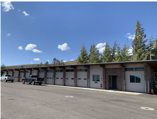
Utility building at Craters of the Moon National Monument and Preserve.

Idaho's national parks protect natural and historic sites, including volcanic formations at Craters of the Moon National Monument and Preserve, Pliocene fossils at Hagerman Fossil Beds National Monument, and a World War II Japanese American incarceration site at the Minidoka National Historic Site. The project will address facility deficiencies at each of these sites, such as installing energy efficient utility systems, updating fire safety and suppression systems, and upgraded maintenance facilities and equipment. This work will improve safety, protect resources and assets, and allow the parks to continue mission-critical work.