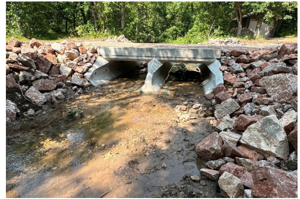
Photo Caption: Newly replaced creek crossing at the Alkali Creek Campground