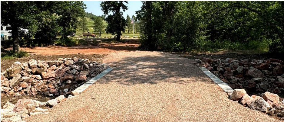
Photo Caption: View from the trail over the newly replaced creek crossing at the Alkali Creek Campground

The Centennial Trail was created in 1989 to celebrate the 100 th year of South Dakota statehood, and passes through State Park, National Park, National Forest, and Bureau of Land Management lands. Trail users experience a full range of natural environments, including open high plains, forests, meadows, riparian areas, and rock outcrops. This project replaced an unsafe creek crossing at the site that provides access to picnic areas and the Centennial Trail.