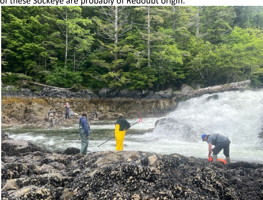
Figure 2. Folks dipnetting for Sockeye at the base of Redoubt falls

In 2022, an estimated 90,005 Sockeye Salmon passed through the weir into Redoubt Lake. On July 9, in accordance with the Redoubt Lake Management Plan, the individual/household subsistence Sockeye possession limit was set at 25 and the individual/household subsistence Sockeye annual limit was set at 100. Preliminary personal use/subsistence harvest records indicate that 5,850 Sockeye Salmon were harvested from the Redoubt system under 246 subsistence/personal use permits. Approximately 5,549 Sockeye Salmon were harvested in Sitka Sound commercial fishery openings throughout the season. Most of these Sockeye are probably of Redoubt origin.