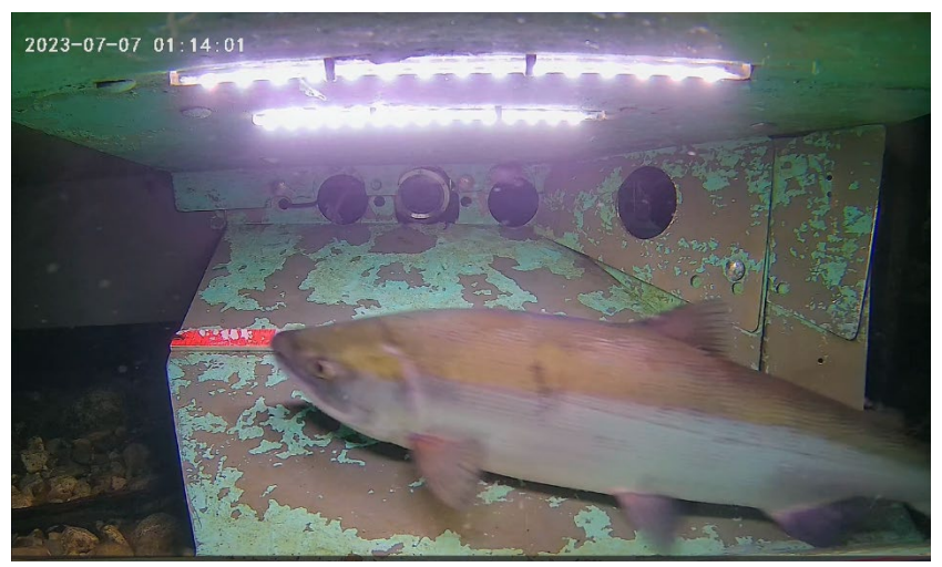
Figure 1. Video capture of a Sockeye swimming through the Neva Lake weir.