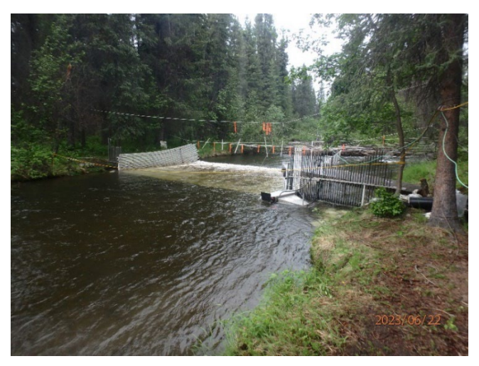
Tanada Creek Salmon Weir, 2023

With funding through the Fisheries Resource Monitoring Program (FRMP), WRST is again operating the Tanada Creek salmon weir located at Batzulnetas. As of August 12, preliminary count estimates are of 4,118 Sockeye Salmon and 8 Chinook Salmon passing the weir. Through this date of the season, the count of salmon passing the weir is well below average.