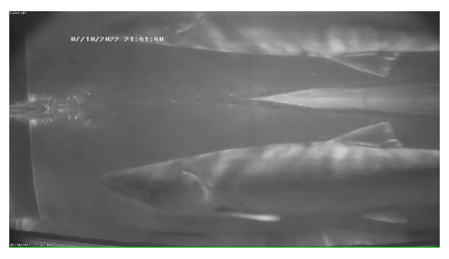
Underwater Image of Sockeye Salmon Passing the Tanada Creek Weir, 2022

The total Copper River District commercial harvest reported by the Alaska Department of fish and Game (ADFG) for the season through August 12 is 591,154 Sockeye Salmon, 11,625 Chinook Salmon, 1,503 Coho Salmon, 59,107 Pink Salmon, and 13,222 Chum Salmon.