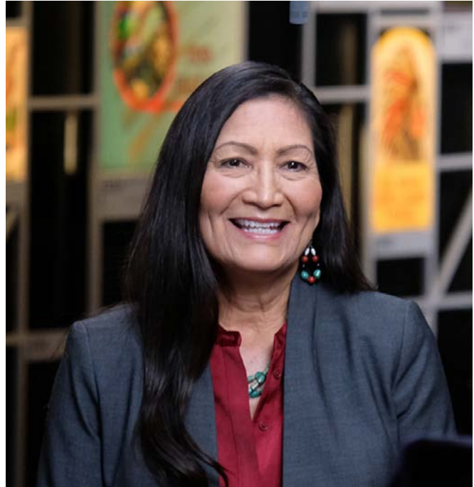
Secretary Deb Haaland, April 1, 2021.

Promoting Equity and Diversity —The budget includes $6.8 million as part of a Departmentwide Diversity, Equity, Inclusion, and Accessibility budget initiative to address identified high-priority needs in support of Executive Order 13985, Advancing Racial Equity and Support for Underserved Communities Through the Federal Government, and Executive Order 13988, Preventing and Combating Discrimination on the Basis of Gender Identity and Sexual Orientation. As part of this initiative, the Department, bureaus, and offices will jointly conduct a review of the Diversity, Equity, Inclusion, and Accessibility program across Interior to identify gaps, challenges, and best practices and to examine Department and bureau