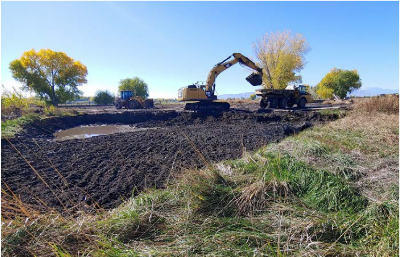
Habitat restoration work in the Provo River delta.