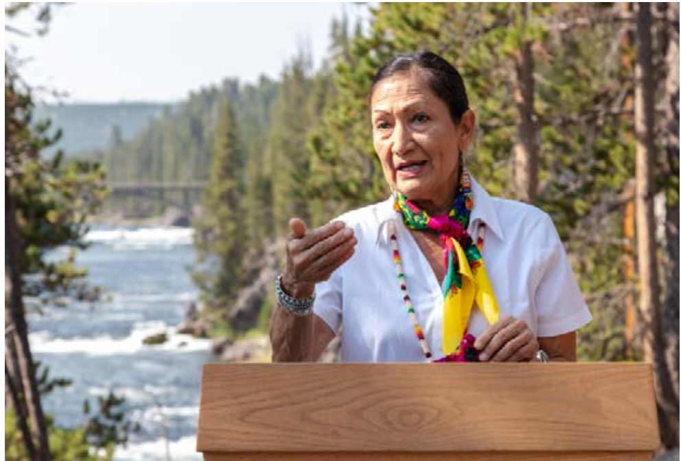
Secretary Deb Haaland speaking at Yellowstone River on August 13, 2021.

budget and maintains Departmental operations, services, and management functions. The 2023 budget continues to propose the transfer of $1.9 million to the SOL Departmental FOIA Office (DFO) to continue efforts to improve the Department's Freedom of Information Act (FOIA) processing quality and capacity and to ensure compliance with the statutory requirements of transparency, accountability, and prompt production.