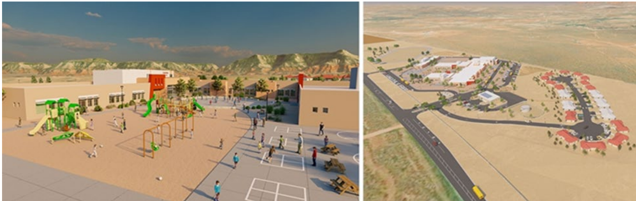
Lukachukai Community School (Conceptual Rendering)

Note 3: F – Project is Funded through the construction phase.