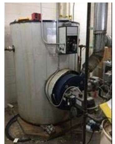
Boiler at Blackfeet Dormitory in Montana

The National Board Inspection Code (NBIC), first published in 1945 as a guide for chief inspectors, has become an internationally recognized standard, adopted by most US and Canadian jurisdictions. The NBIC provides standards for the installation, inspection, and repair and/or alteration of boilers, pressure vessels, and pressure relief devices. IA and DFMC have adopted the NBIC as well as other related national codes as part of its Boiler and Pressure Vessel Policy.